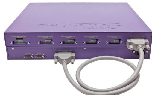
EPS-C2 Connected to a Summit X440