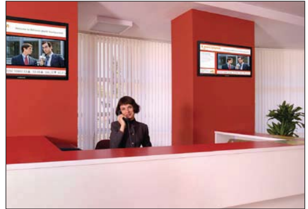
Digital signage can help communicate with employees, sharing information about upcoming programs, boosting morale, and recognizing achievements.

For No. 3, measurability is easy. The advertising model provides a built-in set of metrics that allow a deployer to determine how well the signage initiative is working: advertising sales. For the other five, though, the business case is a bit tougher. Brand messaging and entertainment/customer engagement are long-term endeavors that are not as easily measured; both work on a psychological level with the customer, and the results might not be noticeable for some time, if ever.