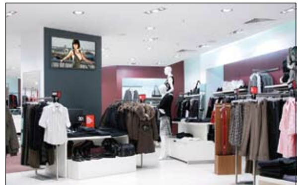
Stores can benefit from digital signage by using it for brand enhancement as well as selling ads on the network for products in the store.