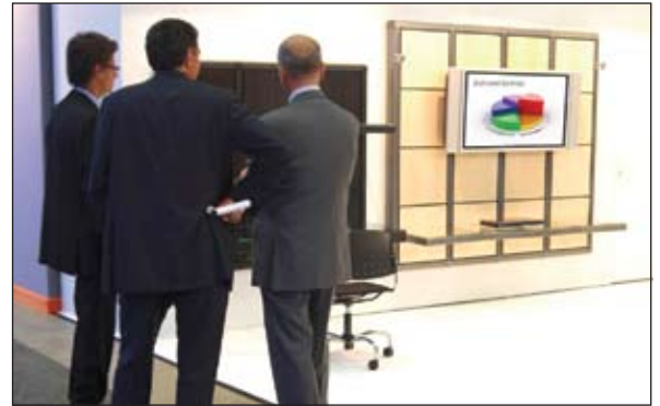
Content is still king—to engage audiences, it needs to be relevant to the people watching it.