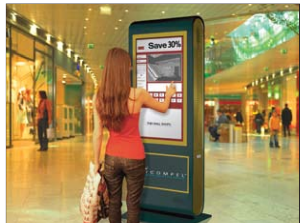
Digital signage can be used to get the attention of passersby, share information, and enhance the retail experience.

Hospitality: Hotel guests, especially business travelers, demand information to guide them in unfamiliar locales. Digital signage does wonders at delivering relevant and helpful information to guests in a hurry and even enables hotels to customize content for arriving groups or individuals. It's used to promote restaurant and bar offerings, sell profitable services (massage, concierge, dry cleaning, etc.), and publicize the location of meeting and fitness rooms and pool hours—thereby reducing the number of calls to the front desk. It also keeps guests informed of offerings outside the hotel, generating a separate stream of revenue through advertising for local restaurants, tour groups, limo and shuttle services, and local attractions, as well as paid content relating to trade shows.